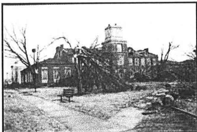
Austin Peay State University Suffered Major Damage