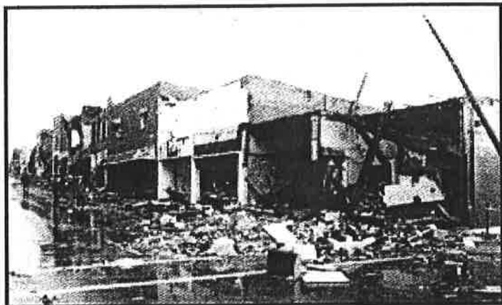
The Damage to Clarksville's Third Street Was Extensive