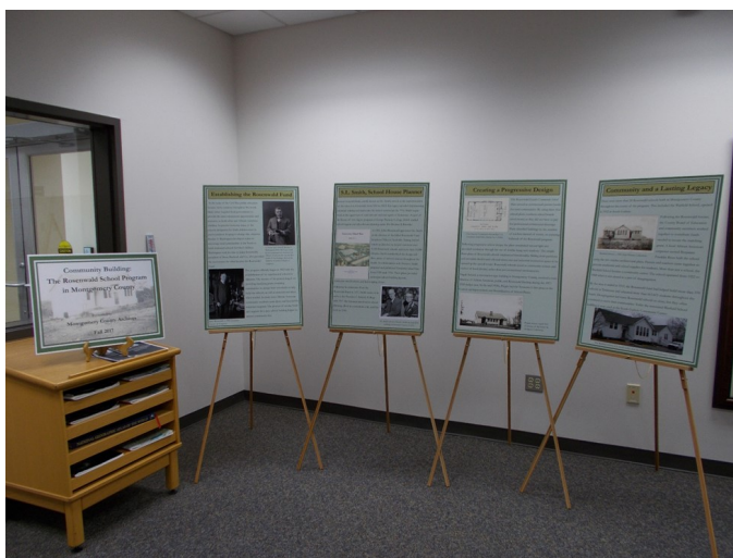
Tennessee Archives Month Exhibit, Community Building: The Rosenwald School Program in Montgomery County

finding a home at the South Guthrie Community Center. To complement the exhibit, we also added several Rosenwald school histories to our library collection for patrons.