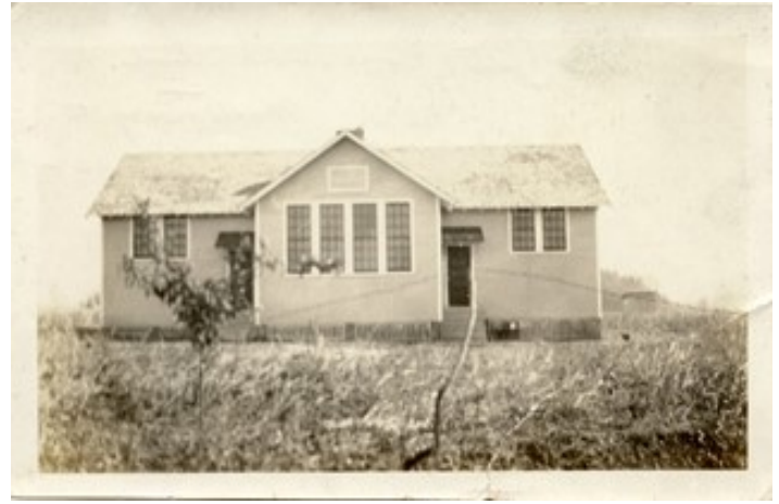
The Warfield School in 1922 (top) and present day (bottom)

The initial plan for Archives Month consisted of developing and installing an exhibit to be on display for our annual open house event. From the beginning, we knew that space was an issue that would inform the design and format of our exhibit. Since our Archives facility does not currently contain built-in display cases, we limited our exhibit to four main panels erected on easels. Space constraints meant we had to place the exhibit in our reference library area. This involved moving furniture around to allow for increased foot traffic in front of the exhibit panels. The physical limitations of our facility motivated us to create an exhibit in a format easily converted into a traveling piece. It is our hope that this exhibit travels around the county before