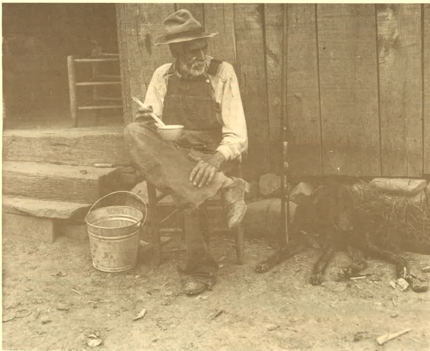
"Home in the Smokies," Conservation Collection, Tennessee State Library and Archives