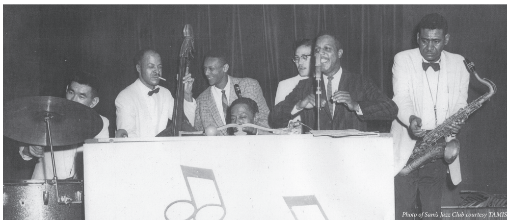
Photo of Sam's Jazz Club

The Newsletter of the Society of Tennessee Archivists