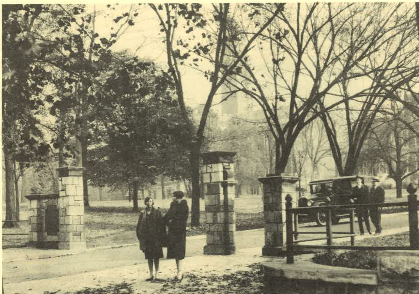
Twenty-third Avenue Gates Vanderbilt University Campus in the 1920s See Spotlight on Page 4