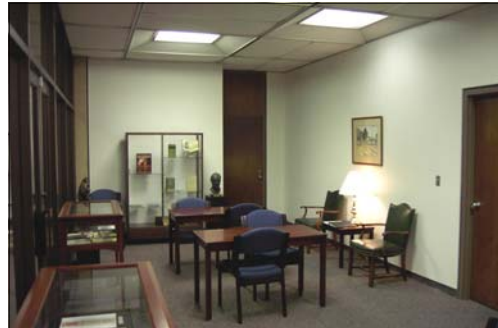
Reading Room in the Special Collections of Lupton Library at UTC