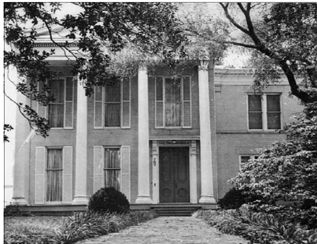
The Pillow-McIntyre House, Memphis and Shelby County Room, Memphis Public Library and Information Center.