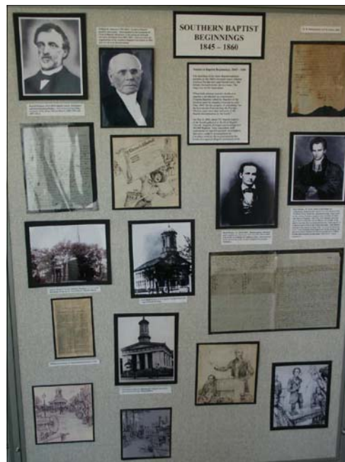
Panel from SBHLA "One Sacred Effort" exhibit describing early history of Southern Baptists

Of prominence in the "One Sacred Effort" exhibit is the original, hand-written Southern Baptist Convention organizational minute book from 1845. (Southern Baptists, like their counterparts in other Protestant denominations in the South during the antebellum period, split from Baptists in the North largely over the slavery issue.) An 1837 letter from Southern Baptists' first missionary, Adoniram Judson; 1849