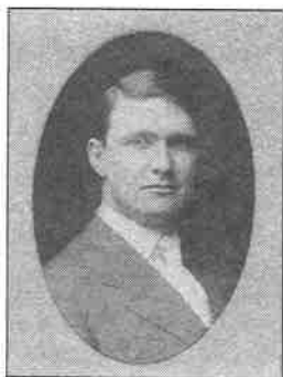
Luke Lea (1878-1945)

Politically, Lea became prominent in 1908 over a split in the state Democratic Party. At the 1908 State Democratic Convention, the Lea faction was able to gain control and secure the nomination for Malcolm R. Patterson, a close ally of Lea. From 1908 until the election of Henry H. Horton in 1931, only one governor was elected without the support of the very powerful Luke Lea. Because of his great influence, Lea became known as the "maker of governors."