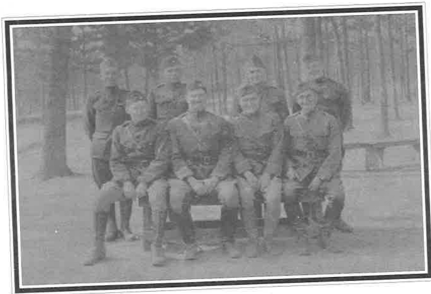
"THE GANG THAT ATTEMPTED TO KIDNAP THE KAISER"