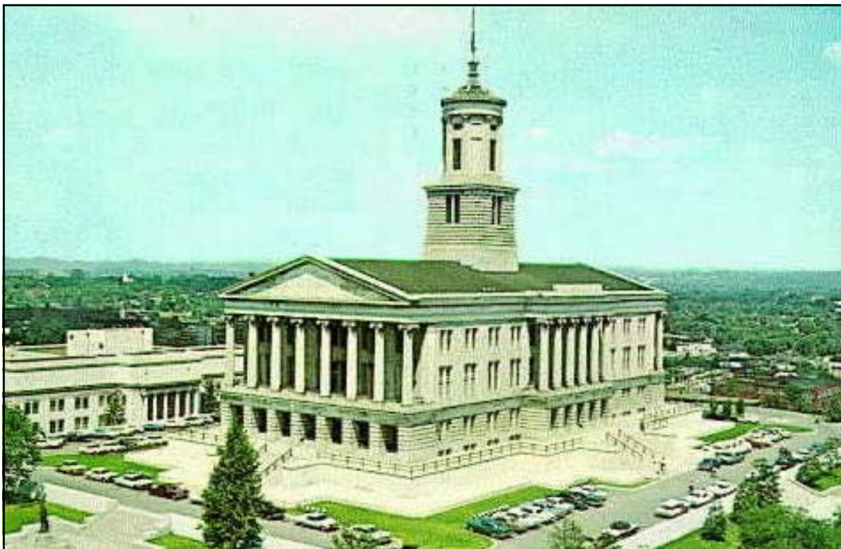
1960s View of the Tennessee Capitol Building in Nashville