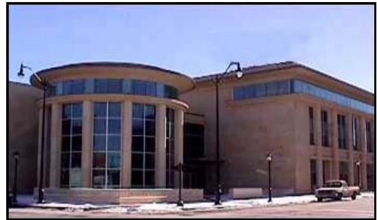
The Abraham Lincoln Presidential Library

On October 14, 2004 the Abraham Lincoln Presidential Library was opened to the public in Lincoln's hometown of Springfield, Illinois. The library's holdings include over 48,000 Lincoln artifacts, including one of only five handwritten copies of the Gettysburg Address. Many of these will be held in the museum part of the library, scheduled to open on April 19 th of this year. In addition to items related to President Lincoln, the library also holds over 12 million items dealing with Illinois history.