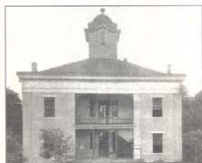
Land, Slaves, and Other Courthouse Transactions 1808 – 1863